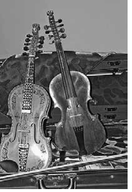
Karen's two fiddles